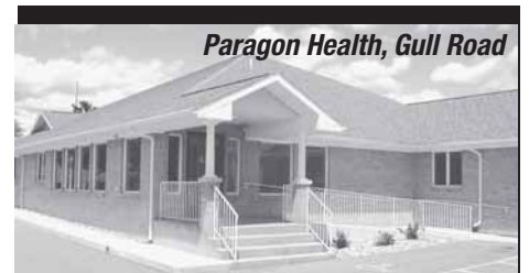
Paragon Health, Gull Road

Vander Weele DESIGN CONSULTANTS, P.C. For All Of Your Engineering and Architectural Design Needs