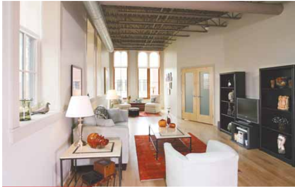
SWMI AIA MERIT AWARD

Allegretti Architects earned an honorable mention for a private residence the firm designed in Bridgeman, Michigan. According to the jury, the residence "builds upon harmonious connections between the inside spaces and the outside through the use of open space, views and windows." The jury also liked the warm materials palette and the inviting spaces created inside. "(The) strength of the project is seen in the use of the stairs as a programmatic component and a poetic hinge that connects the living spaces on the inside with each other, as well as with the plaza on the exterior," the jury wrote.